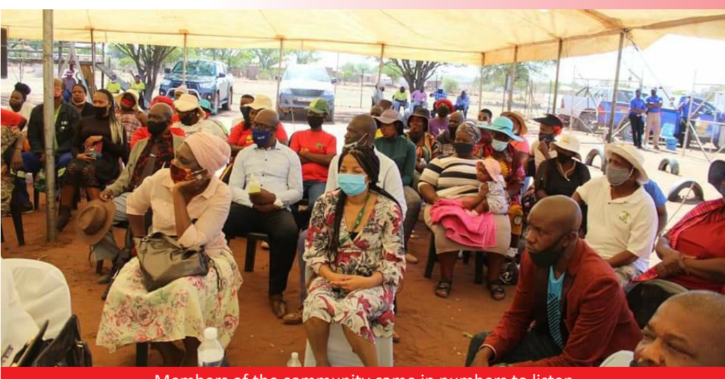
Members of the community came in numbers to listen and interact with their leaders.