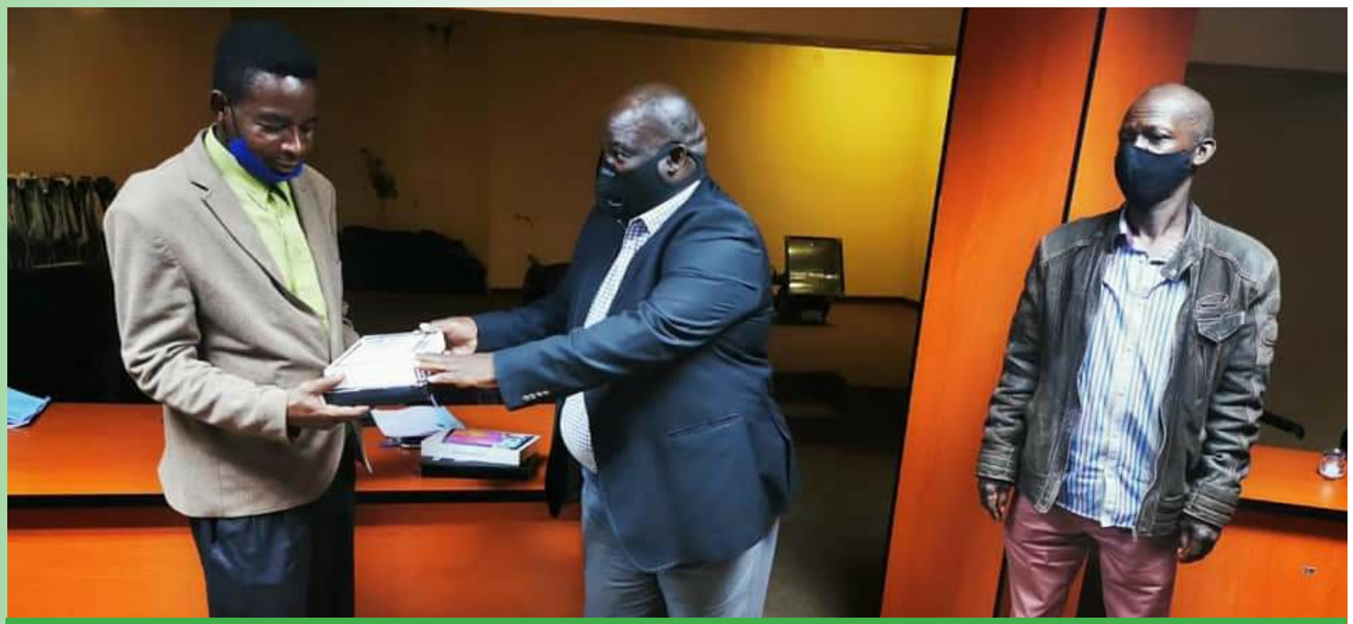
Magoši a lebogile Masepala nakong ya kopano ya kotara-ka-kotara ya magoši.